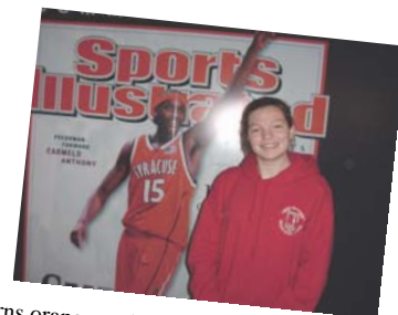
Gear Up turns orange on its college tour to SU.

Share what you know, be a mentor. Call Chautauqua Striders 488-2203 or www.chautauqua-striders.org .