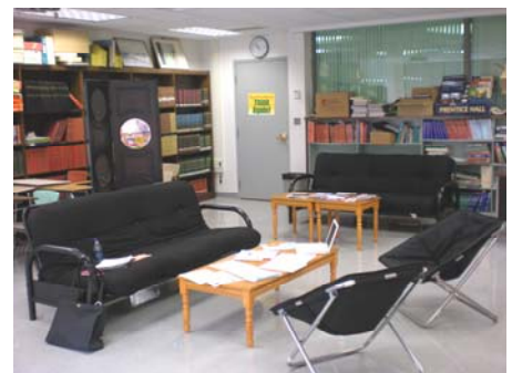
New mentoring room at JHS