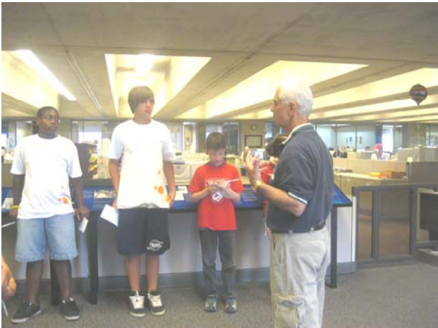
Career Explorers trip to The Buffalo News funded by a grant from the United Way of Northern Chautauqua County.