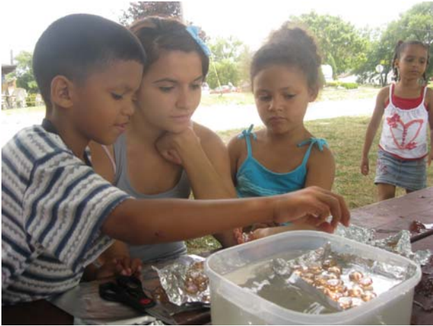
Gravity and buoyancy science experiment during Summer Academic Enrichment Program.

Career Explorer field trips, science experiments, a talent show, and immense fun were all part of the Summer Academic Enrichment Program conducted by Striders at the Boys & Girls Club of Northern Chautauqua County. Students experimented with buoyancy, gravity, and water pressure; sorted the fat molecules in milk; and during a trip on a sailboat to the Buffalo Outdoor Urban Education Program, learned about Lake Erie aquatic life. The annual talent show was held in August and featured singing, joke telling, dancing, and poetry. North County programming is in full swing. We welcome back all of our terrific students and their families and look forward to one of the best tutoring years ever!