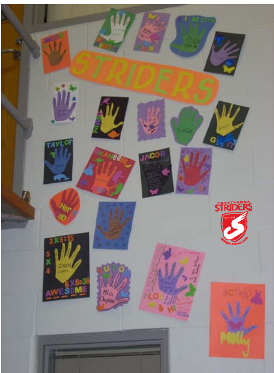
"Lots of High Fives" on the Striders' Wall at Thomas Jefferson Middle School.

Middle school tutoring is in full swing at Jefferson and Washington. Currently, there are 84 students registered in both programs and all are scheduled to attend at least once per week. Enthusiastic and knowledgeable tutors at each school are setting up daily routines and also offering great educational activities designed to meet the different needs of diverse student populations. Jefferson Striders' Wall is now adorned with cutout handprints that tell interesting facts about the artists who made them. At Washington, students open tutoring with "The Question of the Day," designed to generate discussion about interesting facts or challenges facing middle school students.