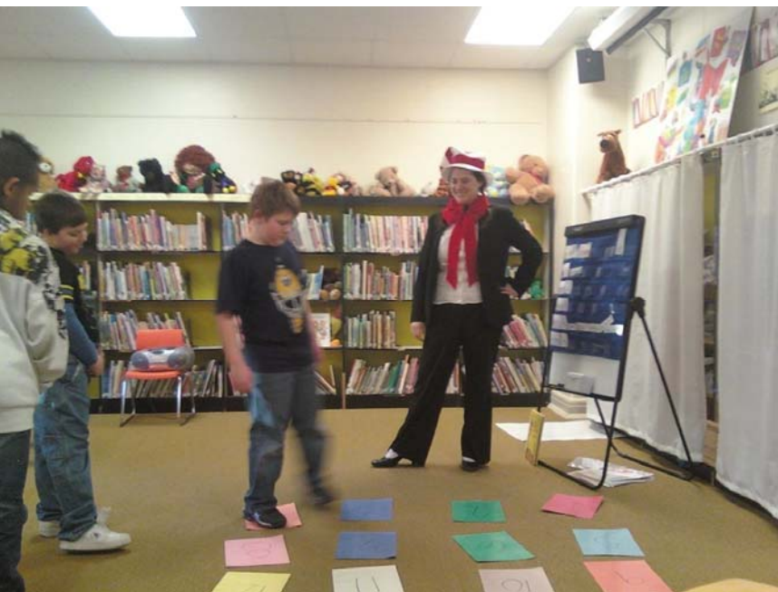
Fletcher Elementary Strider students celebrated Dr. Seuss' birthday with style!

Students could select more than one check box, so percentages may have added up to more than 100%.