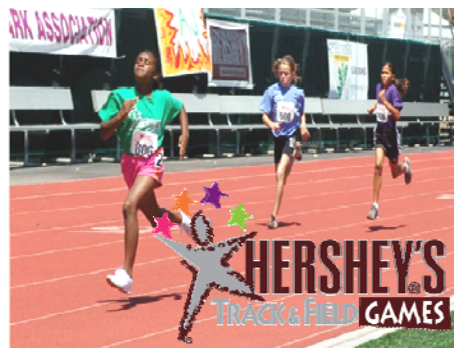
12 area athletes who participated in the Hershey's Track & Field Games at Strider Field will compete and represent our area in the NYS West Championships in Herkimer, NY on Saturday, June 19.

Chautauqua Striders was founded in 1979 as a track and field program for young people. Since then, thousands of young people have participated in athletics through a Chautauqua Striders. Our programs both introduce the events, as well as, prepare the area's best for regional and national competitions.