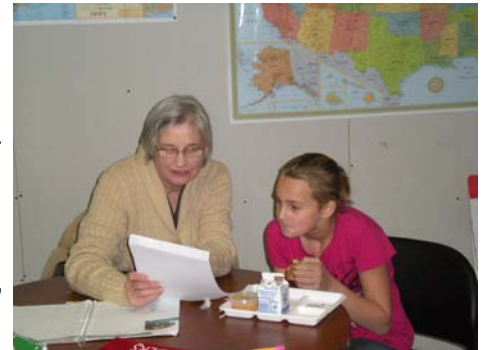
Mentoring at George Washington Middle School

Chautauqua Striders has mentees in community and school-based mentoring who attend Jefferson, Persell, and Washington Middle Schools, Ring, Love, Fletcher, Bush, and Lincoln Elementary Schools, and Jamestown High School. In addition, Chautauqua Striders has mentees in the community based program who attend Southwestern Elementary School, Southwestern Middle School, Falconer Middle School, and Frewsberg Middle School.